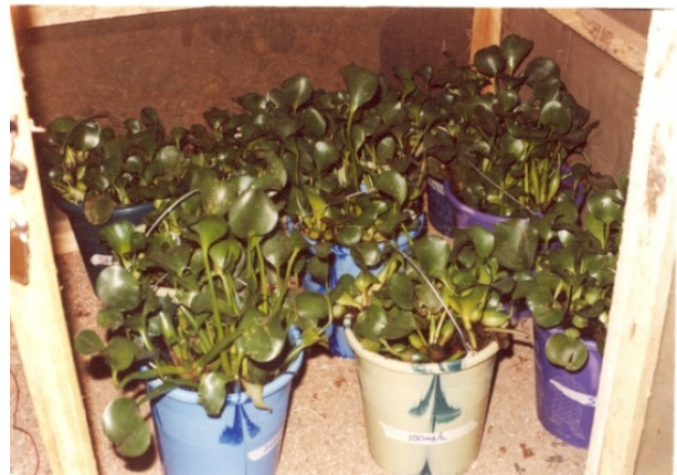
The Water Hyacinth