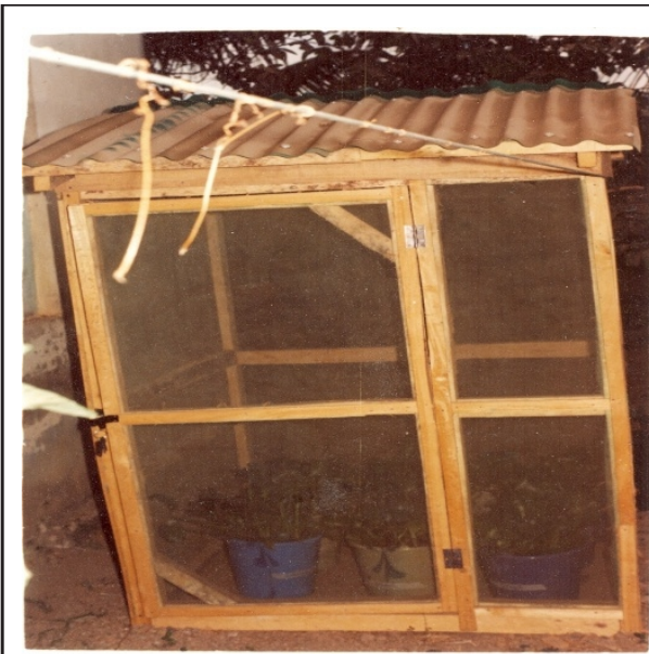
The Green House

Water Hyacinth ( Eichhornia crassipes Mart. Solms) (Figure 2) was rinsed with de-ionized water to remove any epiphytes and insect larvae grown on plants, and then it was cultivated in the green house. The uptake of metals is greater in plants grown in pots of water in the greenhouse than from the same water in the field (De Vries and Tiller, 1978; Page and Chang, 1978)